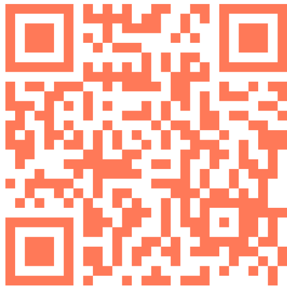
Sorority Life Interest Form