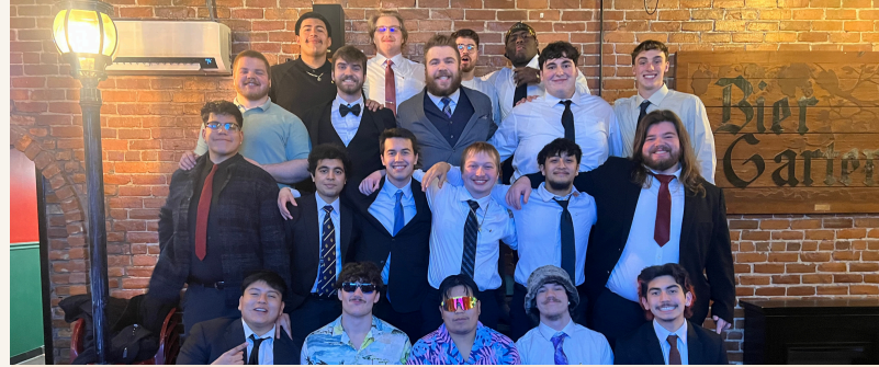
Beta Theta Pi Formal