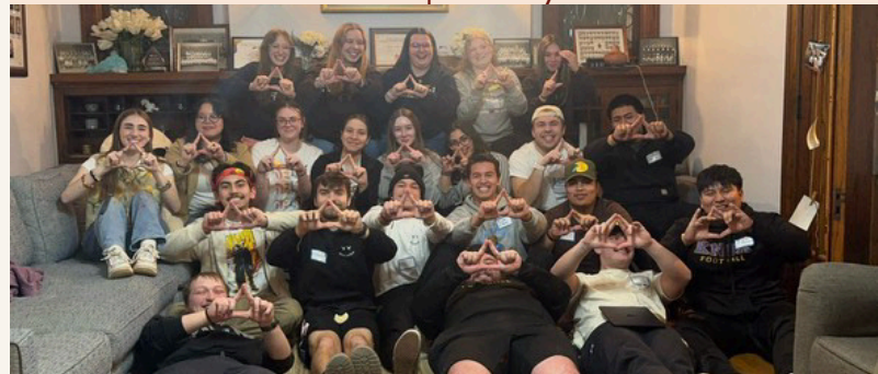
Tri Delta and Beta Theta Pi Hangout