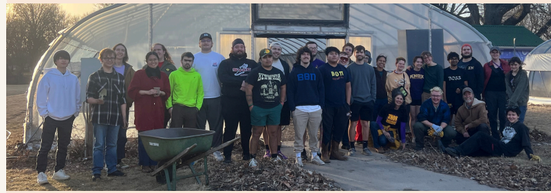
Knox Farm Clean Up on Day Of Service